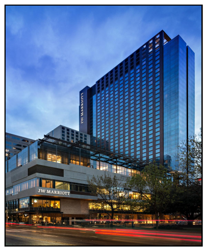
JW MARRIOTT AUSTIN