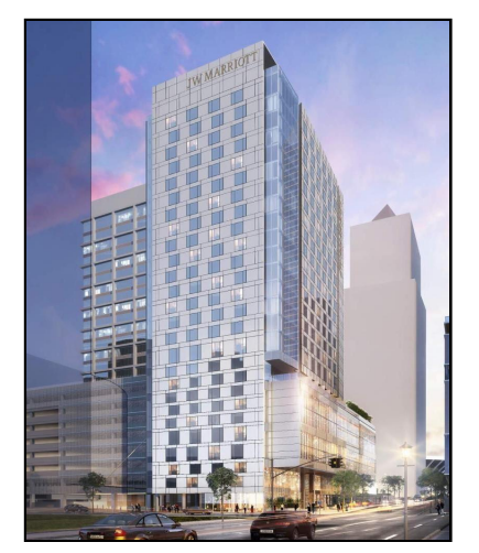
JW MARRIOTT CHARLOTTE