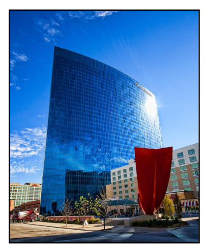
JW MARRIOTT INDIANAPOLIS