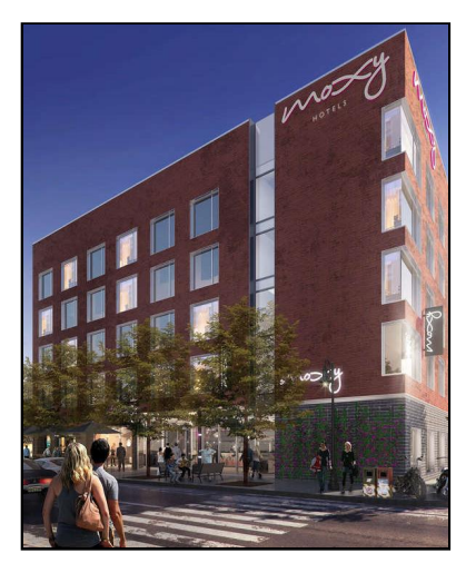
MOXY UNIV. OF TEXAS AUSTIN